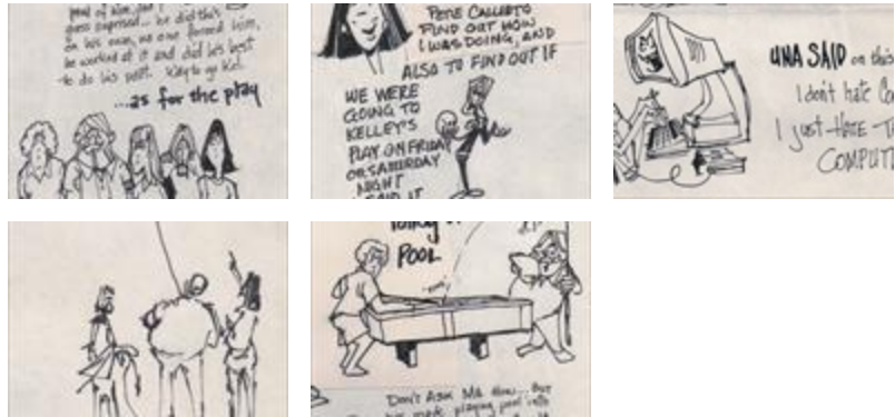
Roy Garland III - January 31, 2018 at 04:37 PM

“ 26 files added to the album Art that might make you smile